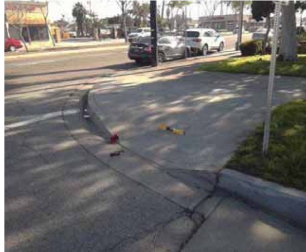
Curb Ramp , Landings and Transitions : Top Landing Clear Length - Landings

Code Reference ADA 406, 406.4, CA 11B-406.5.3