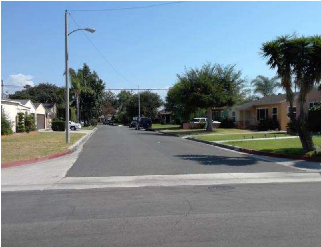
Pomering Road - Arnett Street to Pivot Street

Arnett Street to Pivot Street Downey, CA 90242