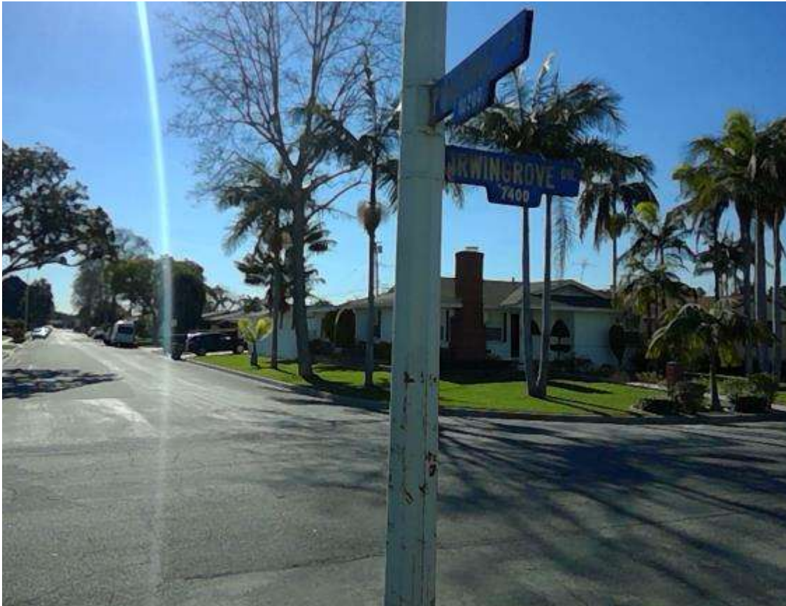
Pomering Road - Irwingrove Drive To Quinn Street

Irwingrove Drive To Quinn Street Downey, CA 90241