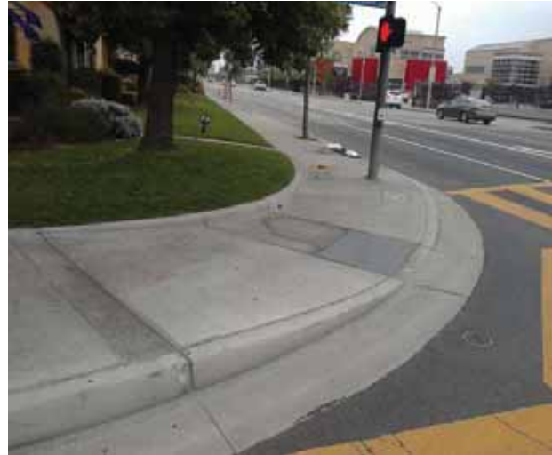
Curb Ramp , Landings and Transitions : Top Landing Right Side Slope - Parallel Curb Ramp

Code Reference ADA 406.4, 403.3, 406.1, CA 11B-406.5.3