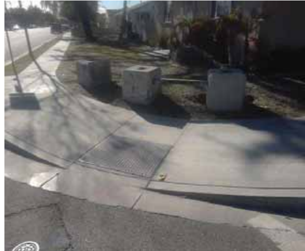
Curb Ramp , Landings and Transitions : Top Landing Right Side Slope - Parallel Curb Ramp

Code Reference ADA 406.4, 403.3, 406.1, CA 11B-406.5.3