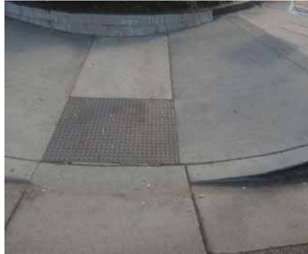
Curb Ramp , Landings and Transitions : Top Landing Right Side Slope - Parallel Curb Ramp

Code Reference ADA 406.4, 403.3, 406.1, CA 11B-406.5.3